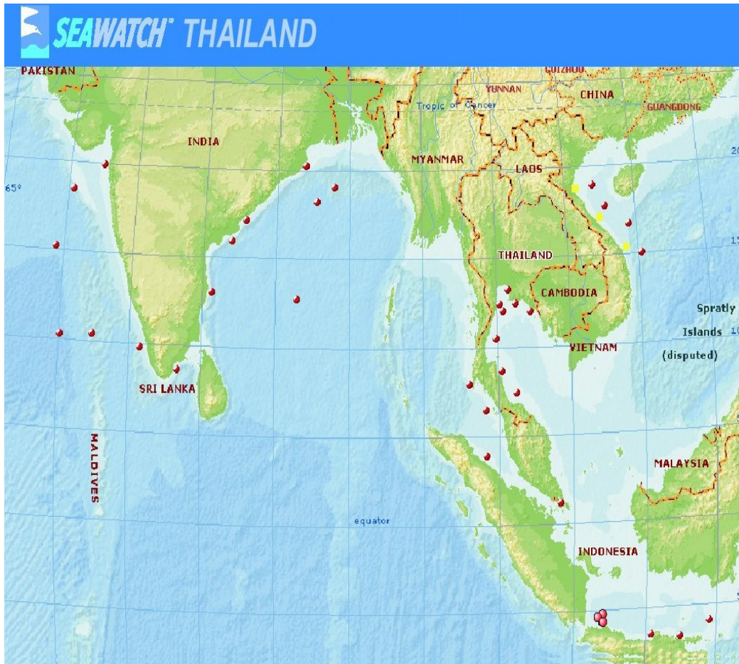
Significant Wave Height for the period leading up to the Supercyclone on 29th/30th October 1999